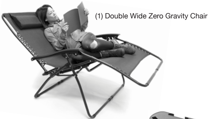
(1) Double Wide Zero Gravity Chair